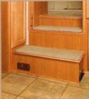
Hardwood steps with removable carpet pads.