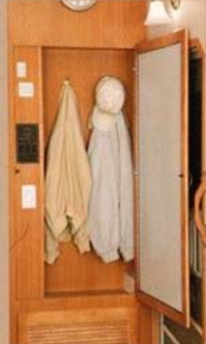
Entry closet, beautifully concealed.