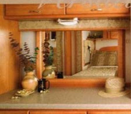
Design and function combine in slide-a-way vanity mirror and day/night window shade combo.