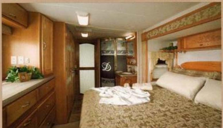
Etched glass sliding bed/bath entrance door and retractable privacy panel