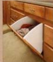
Hidden hamper for your convenience.