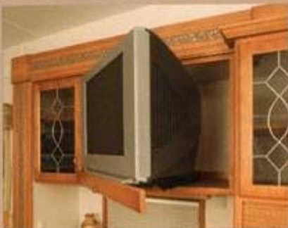
Glide out/swivel TV shelf allows comfortable viewing from every angle... oh, don't forget the surround sound!