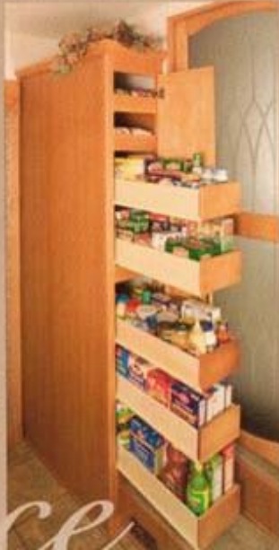
Pantry space galore.