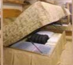
Patented Power King Sleep System features innerspring bed base, Qualux Comfort mattress, power-lift king (option) and lift assisted under-bed storage space.